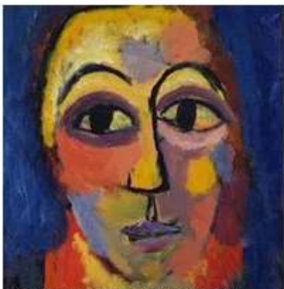
Head (1910) Alexei von Jawlensky Museum of Modern Art, New York

In his green stripe portrait of his wife, Matisse has used color alone to describe the image.