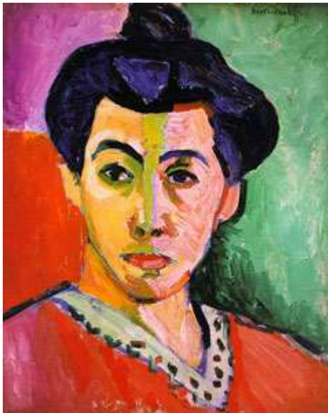
Henri Matisse Green Stripe (Madame Matisse) 1905

In his green stripe portrait of his wife, Matisse has used color alone to describe the image.